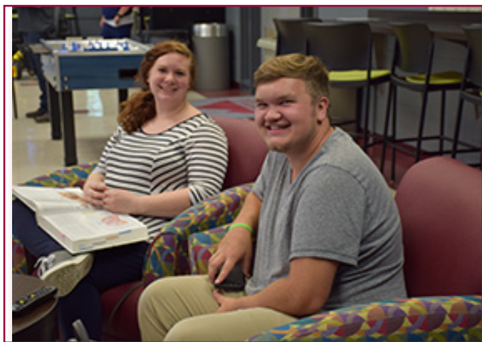
Students make use of the newly renovated Student Lounge in Fincastle Hall.

Students register for courses during the official registration period. In the event that a class is closed, students must see