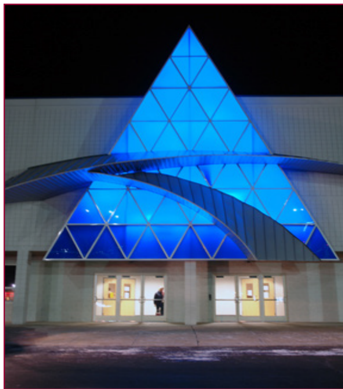
The Crossroads Institute is located at 1117 East Stuart Drive in Galax.

WCC at the Summit Center for Higher Education is located in downtown Marion about 30 miles south of Wytheville on Interstate 81. The Summit supports WCC curricular offerings, continuing education programs, and community service. Educational activities at the center include day and evening courses, business- and industry-related training, pre-employment training, seminars for small business owners, and personal development workshops. For more information regarding WCC educational opportunities in Smyth County, call the Summit Center at (276) 783-1777.